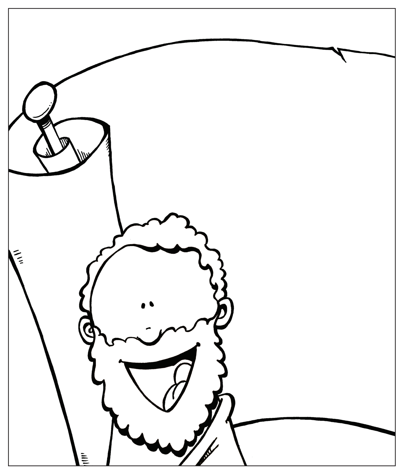
Paul wrote letters to share God's love.